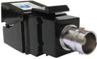
Quick Connect Video Balun BNC Female IDC Keystone Part Number: E10185SC