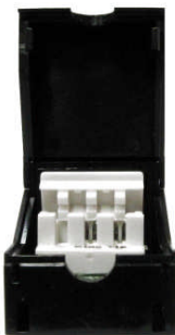
Rear View of E10185SC