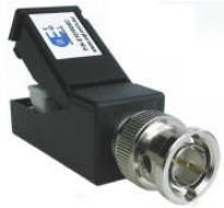
Quick Connect IDC P/N: E10180C