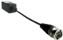
RJ45 Slim Case 100mm Tail P/N: E10180T