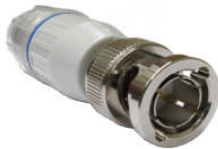
Push Terminal Easy Connect P/N: E10180V