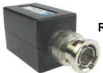
RJ45 Standard Case P/N: E10184S