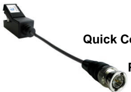
Quick Connect IDC Slim Case 100mm Tail P/N: E10180TC