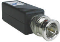
RJ45 Slim Case P/N: E10180R